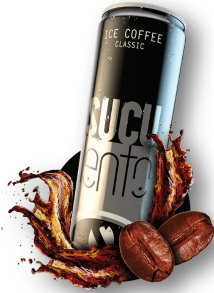
ICE COFFEE CLASSIC