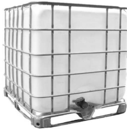
1000 litres IBC