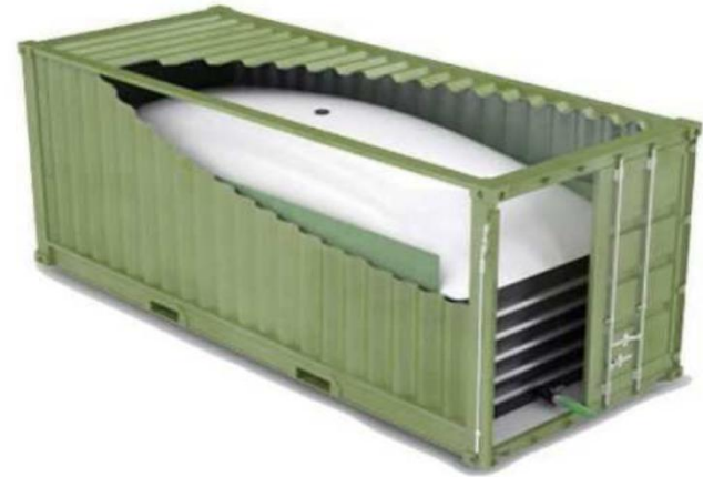
21,000 kg Flexitank