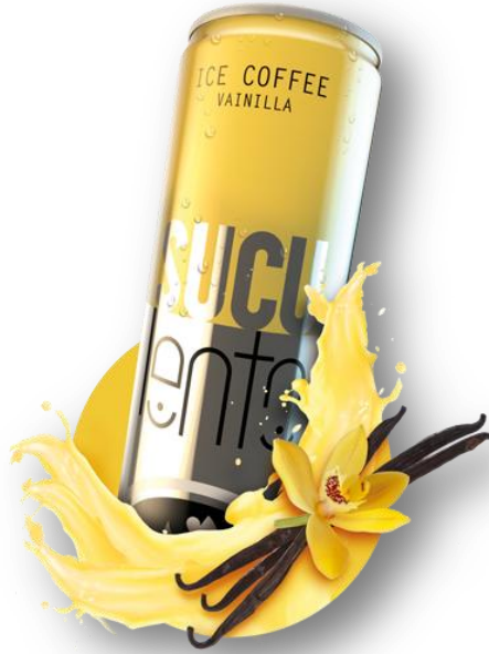
ICE COFFEE VANILLA