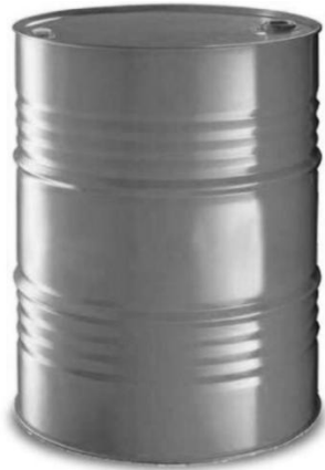
200 kg Drum