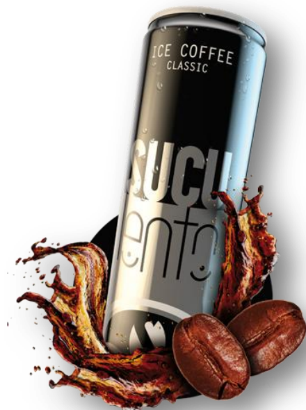
ICE COFFEE CLASSIC