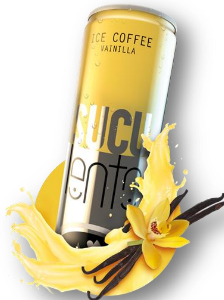
ICE COFFEE VANILLA